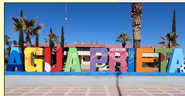
Dinner & Concerts in the Plaza Saturday Evening